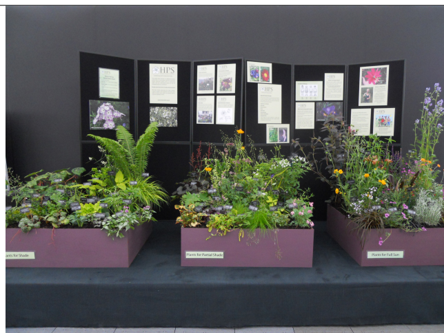
Chatsworth HPS Stand 2019